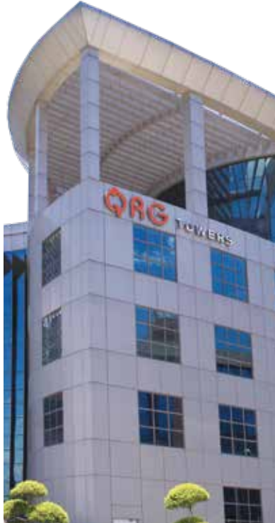
CORPORATE OFFICE, NOIDA

Driven by a commitment to innovation, quality, and design, the company also upholds sustainable practices throughout its operations, including eco-friendly manufacturing processes and energy-efficient product design, contributing to a greener and more sustainable future.