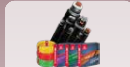
Wire & Cables