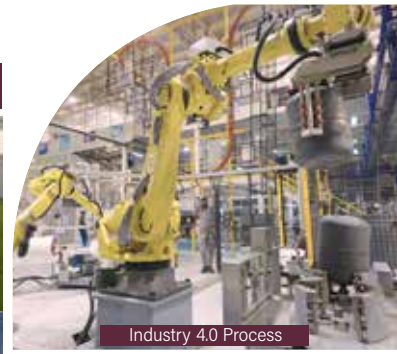
Industry 4.0 Process