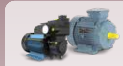
Pumps & Motors