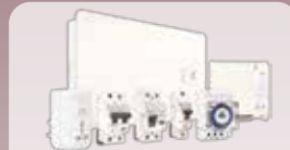
Building Circuit Protection