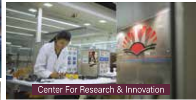
Center For Research & Innovation

16 Manufacturing Units | ~18000 Strong Dealer Network | 4 Research Centres | 48 Offices