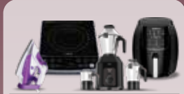
Small Domestic Appliances