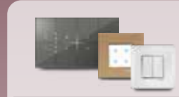
Switches & Automation